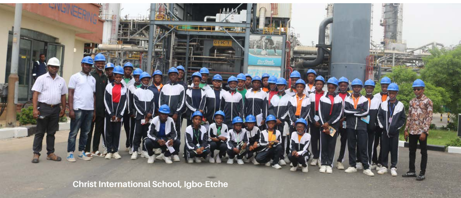
Christ International School, Igbo-Etche

During the visits, the students were given a comprehensive safety briefing, and tour of the Indorama Petrochemicals complex, including the Olefins Plant Control Room, Polyethylene (PE); Bagging Section and finally, the Product Display Centre.