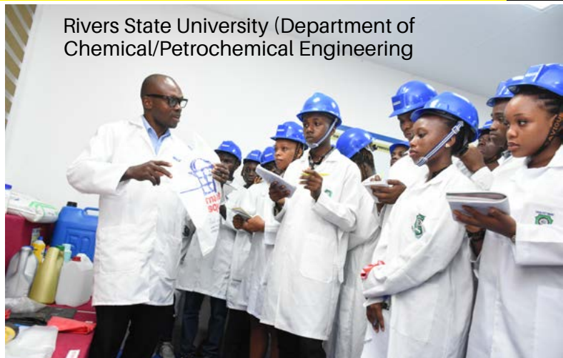
Rivers State University (Department of Chemical/Petrochemical Engineering