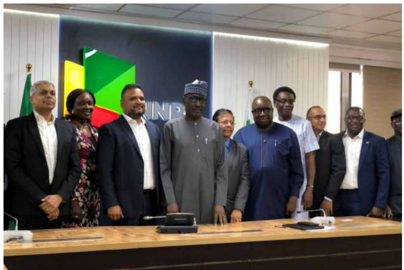
Group photograph of top executives of both Indorama-Nigeria and NNPC after the signing of the Gas Agreement.