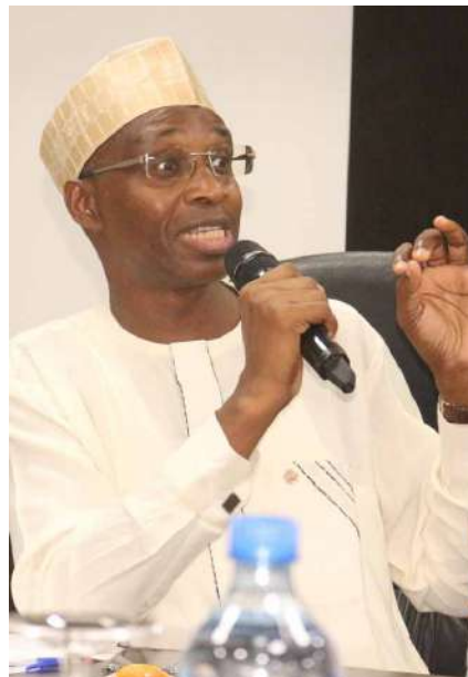
Alhaji Ibrahim Yusuf Permanent Secretary

Others are the Minister of Environment, Rivers State Commissioner of Environment, Federal Controller of Environment, and chairman of Eleme LGA of Rivers state.