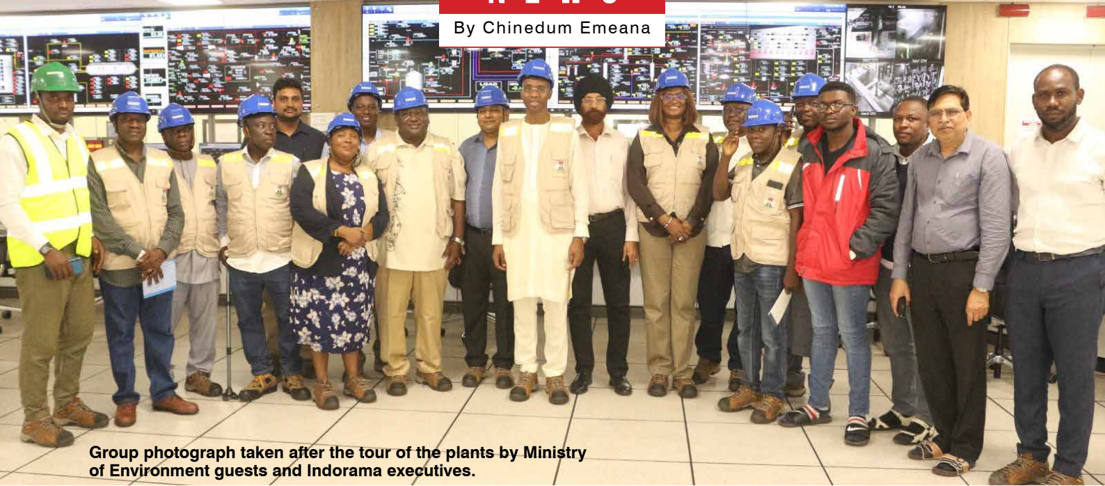
Group photograph taken after the tour of the plants by Ministry of Environment guests and Indorama executives.