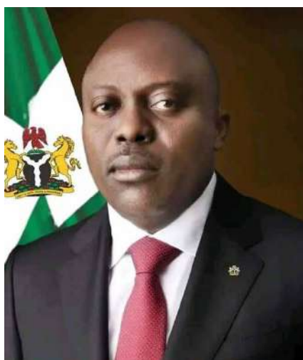
H.E. Gov. Siminlaye Fubara