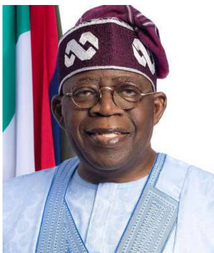
H.E. President Bola Ahmed Tinubu